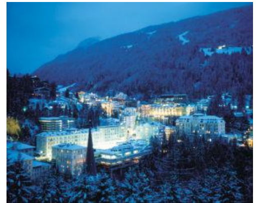
Bad Hofgastein, Austria

gala dinner on final evening, Sunday breakfast with sparkling WINE and salmon buffet. What a deal!