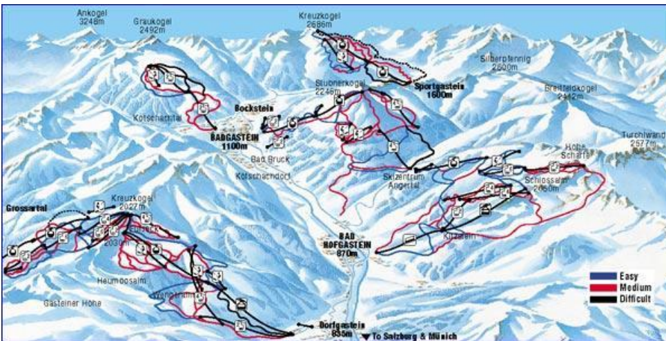
BAD ski area...