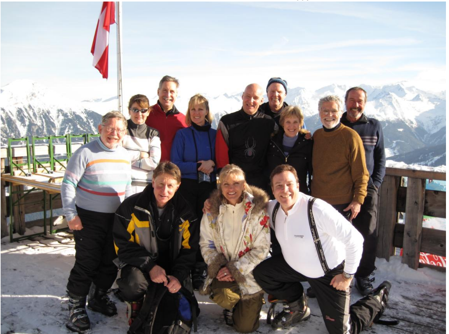
Ibex in Bad Hofgastein, Austria!