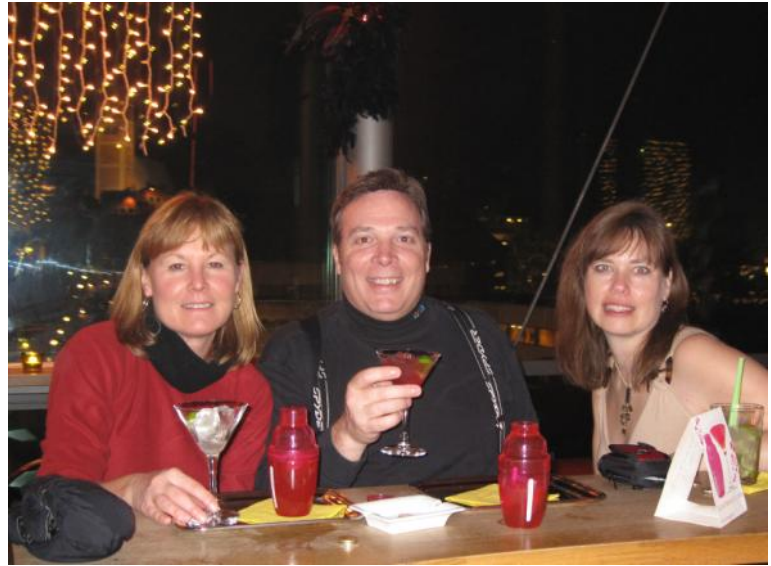
A Happy Ed...