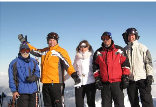
Ibex at Sportsgastein