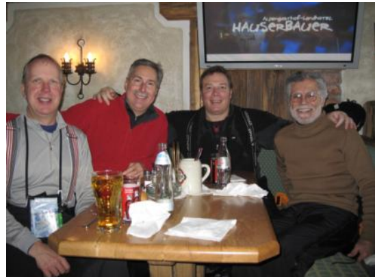
More Dorks at Dorfgastein

Thursday evening, the group planned to go sledging. We had to get to dinner at 6:30 so that we could make the sledging time. Well, dinner took longer than we thought and, even though I