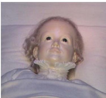
Creepy Lil' Wolfgang...

The group hiked up to the castle on the hill and toured the museum. The group split into a couple of factions. Both groups, we found out later, went to Mozart's birthplace and museum. Now, I like Mozart's music and all, but that museum was just weird. One room had this scary baby doll in a crib. Apparently, it is supposed to be Mozart. I think someone got a hold of an extra Baby Jesus doll from a Nativity scene. Bizarre.