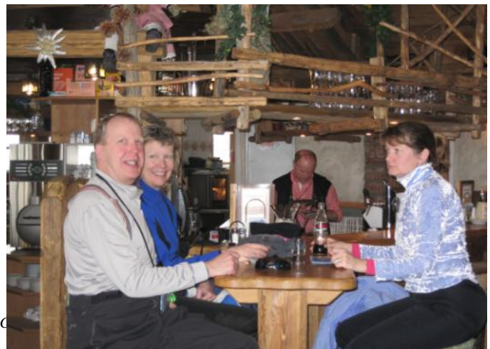
Lunch at Dorfgastein