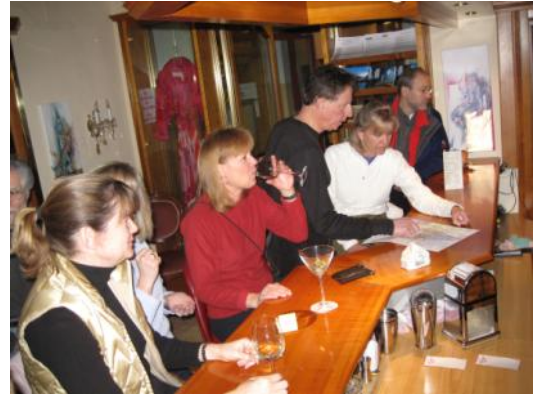
Happy Hour at Hotel

The bus company called and said that they would be late due to bad traffic and an accident. They ended up being about 2 hours late. Luckily there were some restaurants and stores in the terminal