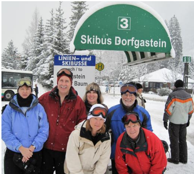
Who put the Dorks in Dorfgastein?