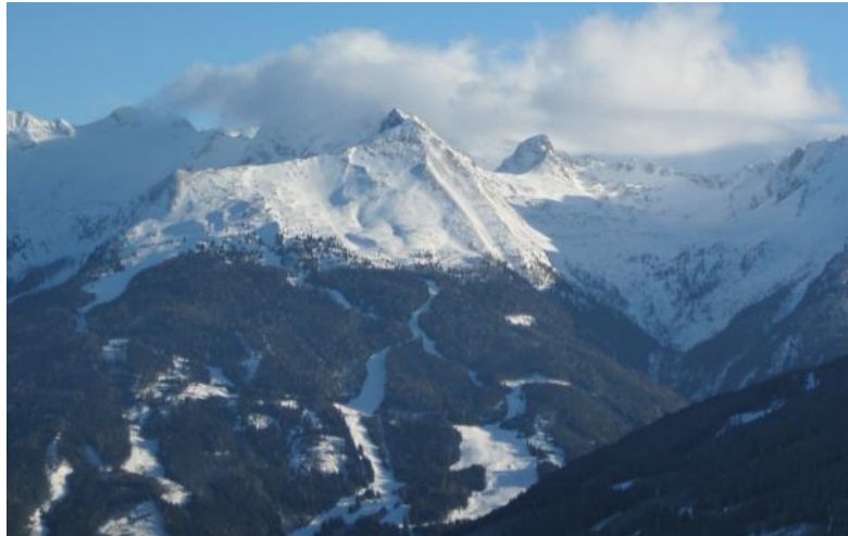
View of Bad Gastein from Bad H

The next had most of the group heading to Dorfgastein. It snowed a lot the night before so we had some