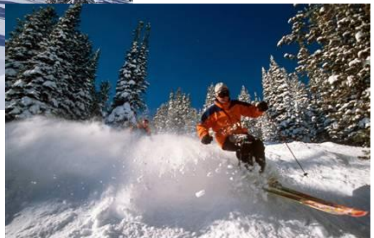
Jackson Hole, WY.