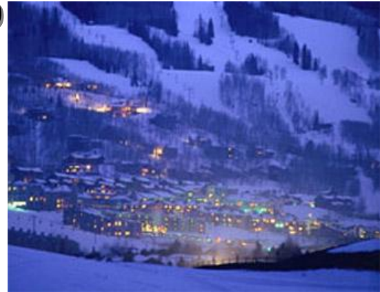
Snowmass village at night

Trip leaders are needed – if you are interested in running one of these trips, please let me know ASAP. We also welcome those who haven't run a trip before to pair up with an experienced trip leader as a trip assistant. It's a great way to become more involved in the club and get to know some really great people too.