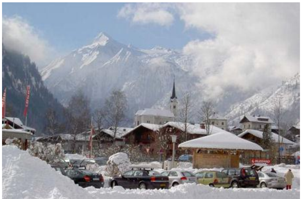
Bad Hofgastein, Austria

Extension: 2 nights at 4*** Hotel Maritim Munich, European Buffet