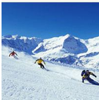
Bad Hofgastein, Austria