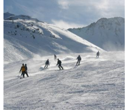
Aspen airport transportation.

We are staying at the Gant of Aspen. The Gant is located on 5 beautifully landscaped acres just a short stroll from exhilarating skiing, shopping, dining and cultural enticements. Each condo is equipped with a full kitchen, private balconies, fireplace, pool, hot tubs, tennis courts, high-speed wireless internet and daily housekeeping. The Gant provides complimentary in-town and